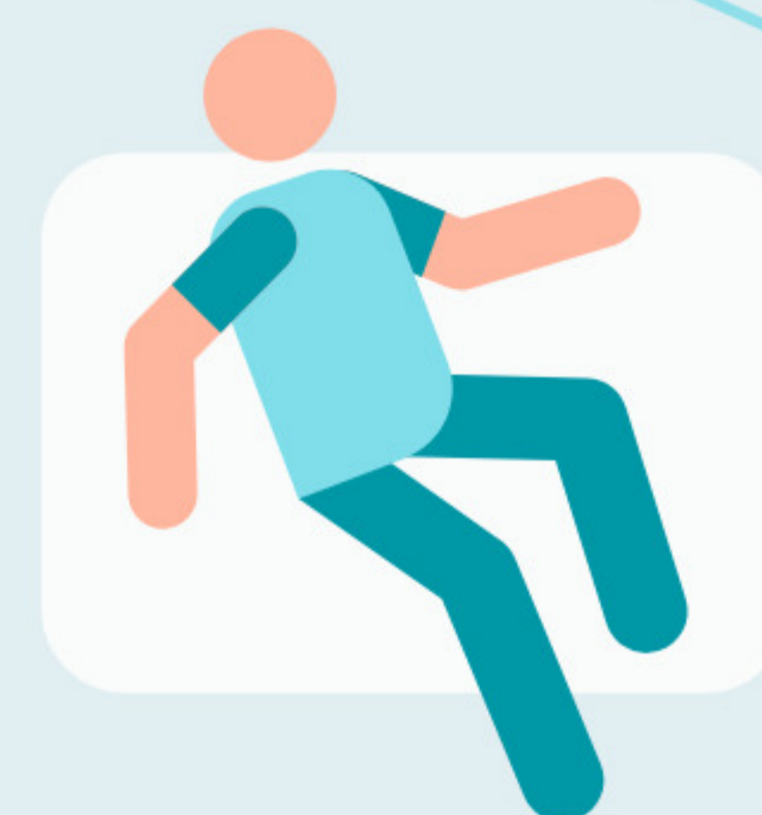
Loss of balance