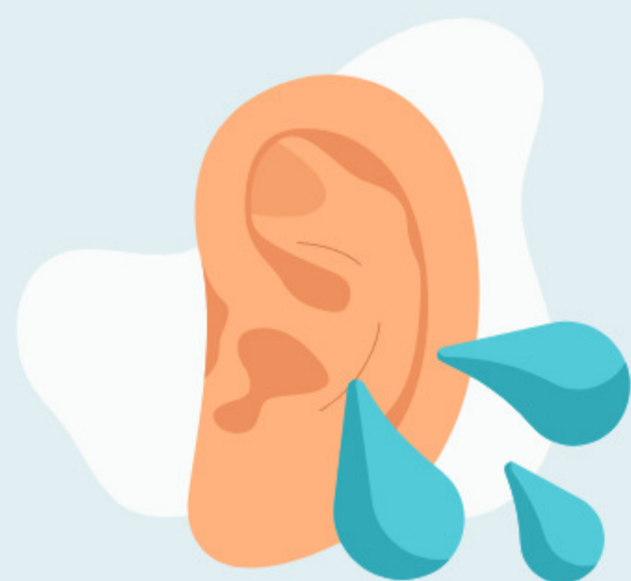
Drainage of fluid from the ear